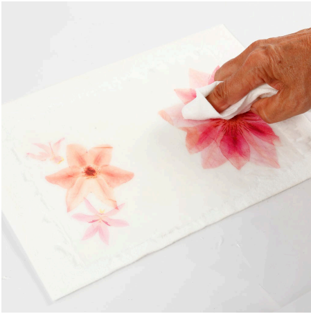
13 Gently press a damp felt cloth on top of the napkin designs. Leave until the paper mixture is completely dry. Remove the paper from the piece of felt.