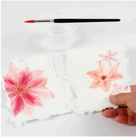
14 Use water and a brush to "draw" a line right through the piece of paper. Carefully tear the piece of paper in two. Leave to dry.