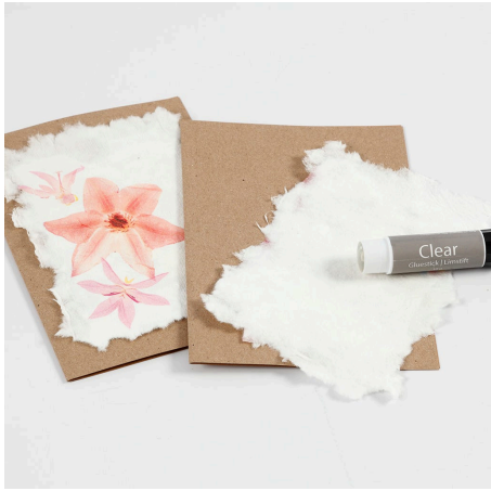
15 Attach the pieces of homemade paper onto the front of greeting cards using a glue stick.