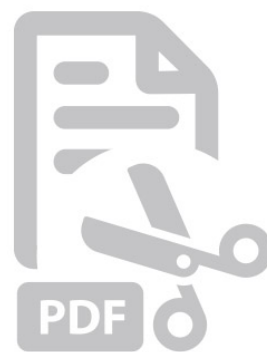
Template Print the template here.