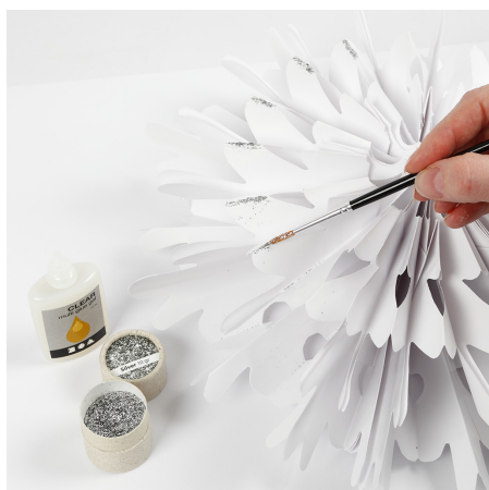
5 Add details by applying stripes of glue and then applying bio glitter to the glue using a brush.