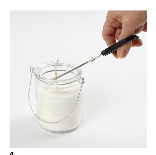
Leave the wax to set and trim the excess candle wick.