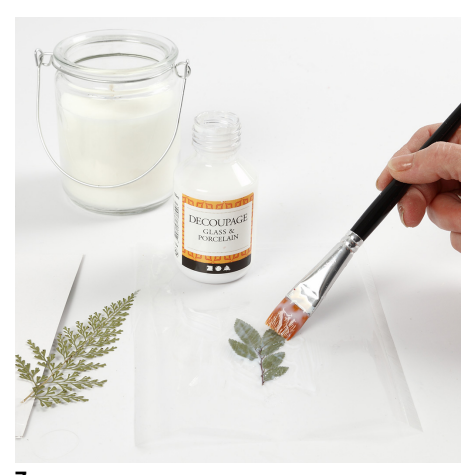
Carefully apply decoupage lacquer onto the entire leaf using a brush.