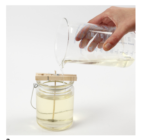
Keep the wick in place with a clothes peg and place the peg across the glass lantern as shown in the photo. Pour the melted wax into the candle holder.