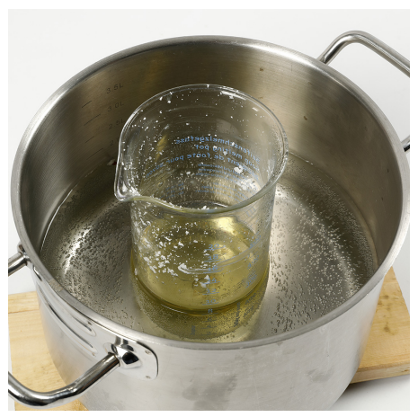
Melt the wax over a water bath. Don't let it boil.