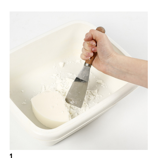
You will need approx. 225 g rapeseed wax for each glass lantern. Chop it into small pieces.