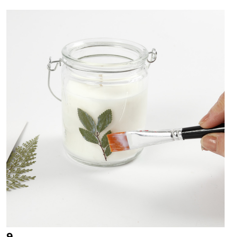
Apply another coat of decoupage lacquer on top of the leaves.