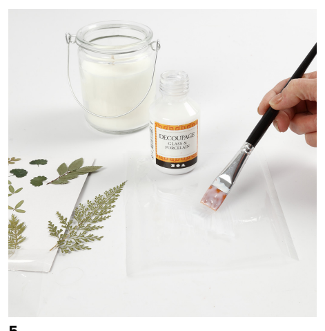
Decorate the glass lanterns with dried flowers. Brush a layer of glass decoupage lacquer onto a piece of plastic. A tip: you may use the packaging from the dried flowers.