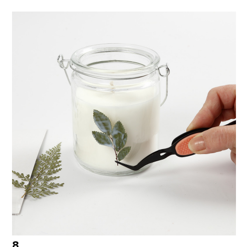
Decorate the glass lantern with leaves.