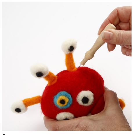
Felt all the parts onto the body.