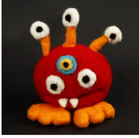
10 This is how a monster could look, but use your imagination.