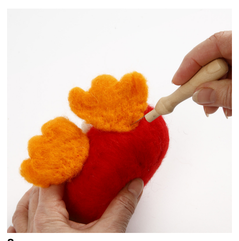
Felt the feet onto the body from underneath.