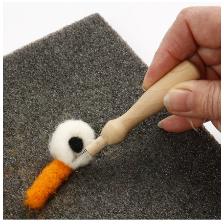
7 Felt the eyes onto the horn.