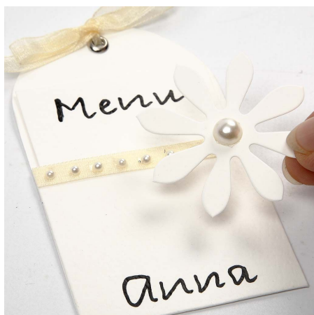
8. To and from cards are used for menu and place cards. Decorate following the same procedure.