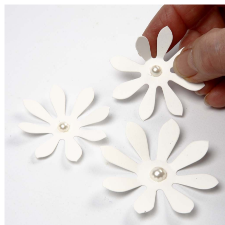
9. Decorate flowers for table decoration with adhesive rhinestone half-pearls and bend the petals slightly upwards.