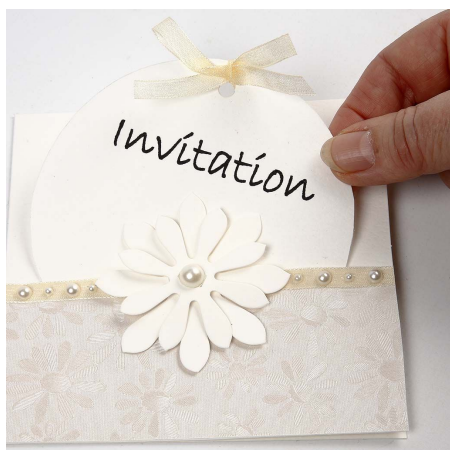
7. Punch a hole and tie a bow with organza ribbon.