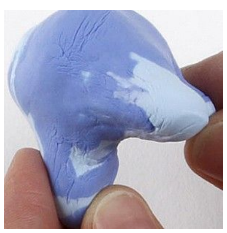
2 Shape three small legs for a little octopus.