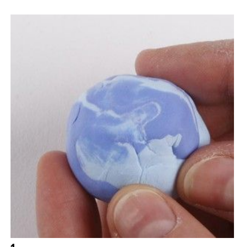
Knead two colours of Silk Clay into each other with your hands and roll a ball.