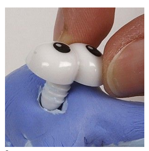
3 Press the eyes into the head.