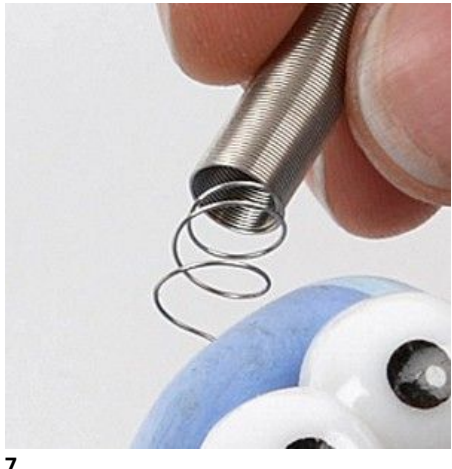
Pull out some of the spring and wind the string around the sucker, until it is in place.