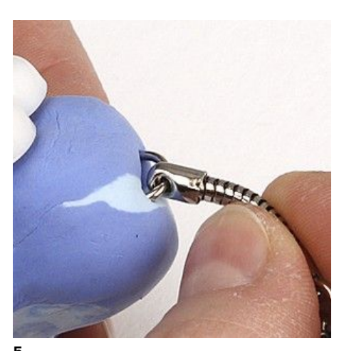
Finally press the key ring on top of the head.