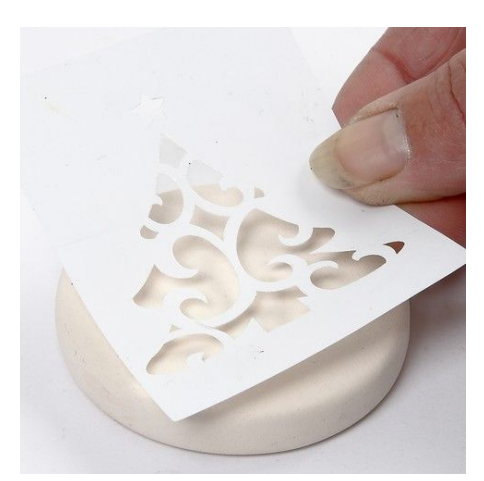
1. Place the flexible stencil securely on top of the terracotta decoration.