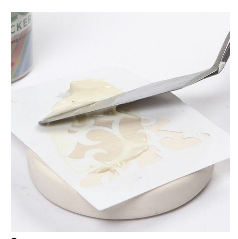
2. Apply Color Blocker onto the flexible stencil design with a spatula. Let it dry.