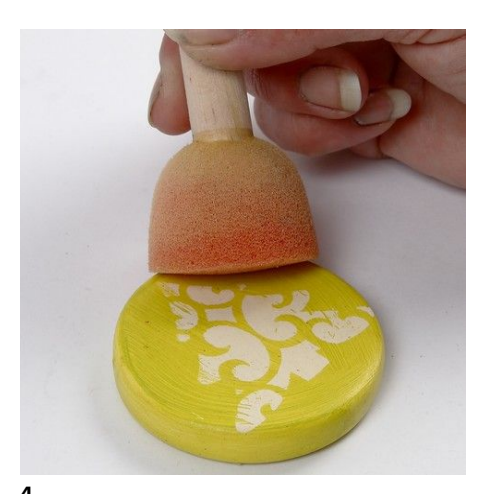
Use a foam stencil brush to carefully dab off the paint on top of the Color Blocker design.