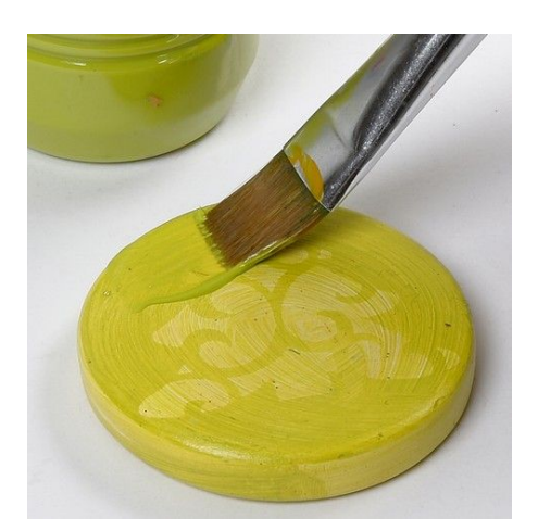
3. Apply a coat of paint. Let it dry.