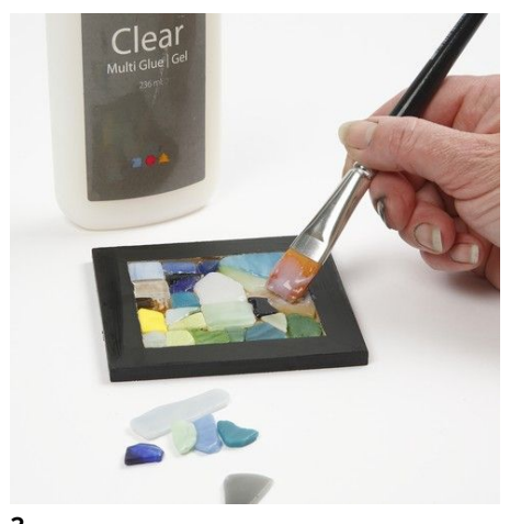
Apply Multi Glue gel onto a small area at a time. Place the mosaic fragments in the wet glue and let it dry.