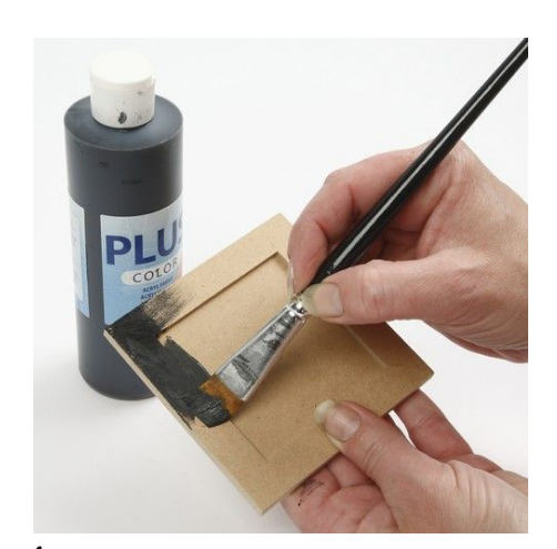
1. Paint the collage frame with Plus Color craft paint.