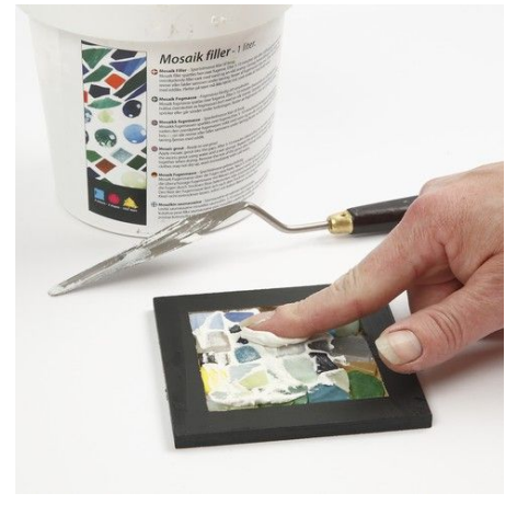
3. Apply the mosaic tile grout in all the cracks using your fingers or a palette knife or a spatula.