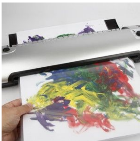
4 Run the picture through the laminating machine.