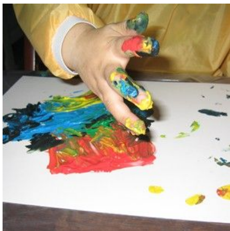
1 Paint a picture with your fingers.