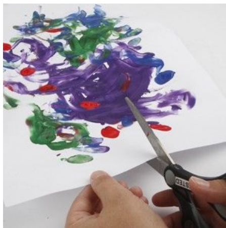
2 You can cut the picture for the candle glass.