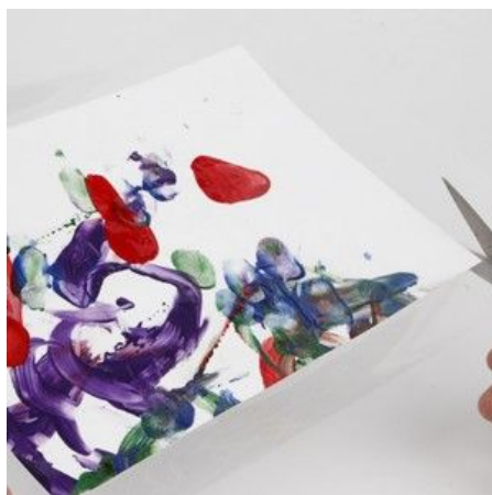
5 Cut off the excess foil.