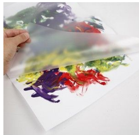
3 Place the picture in a laminating pouch.