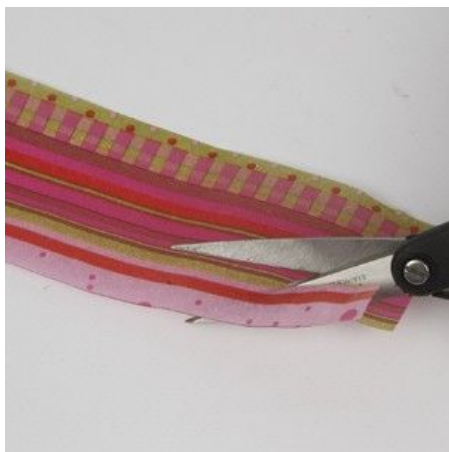
1 Cut out lanes from the silk paper