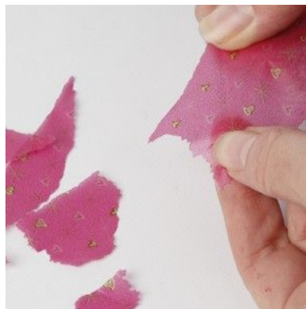
3 Tear the silk paper in to small pieces.