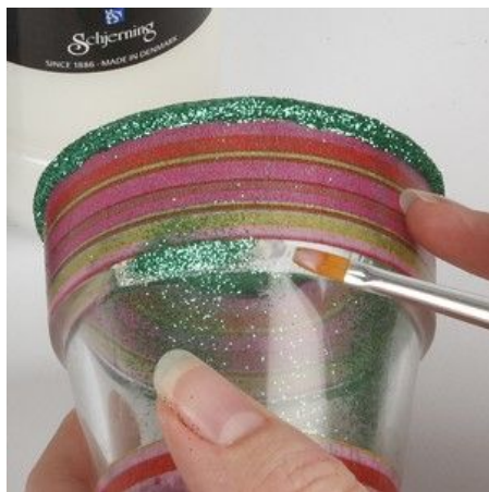
2 Paste on paper and glitter using glass decoupage.