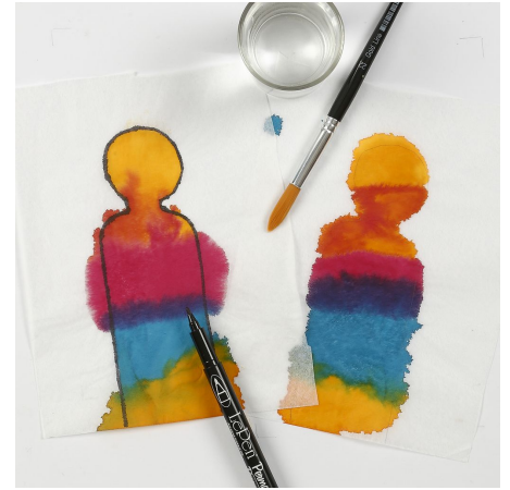
6. The liquid watercolour paint "runs" in particular on the thin and transparent imitation rice paper. We recommend drawing the design with a pen after colouring rather than before. Both are possible and each give a different look.