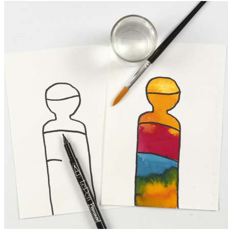
5. The wet on dry technique for painting on defined areas like the example shown here on the paper with the marker-drawn design: Saturate a wet brush into the liquid paint and paint.