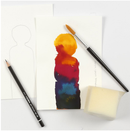
4. The wet on wet technique which makes the paint spread into the paper fibres: Moisten the paper (shown here with a pencil-drawn design) with a sponge and paint.