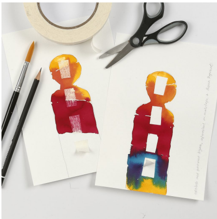
7. The masking of areas on the paper technique, where no paint is wanted: Use small pieces of masking tape and remove these after the painting process.