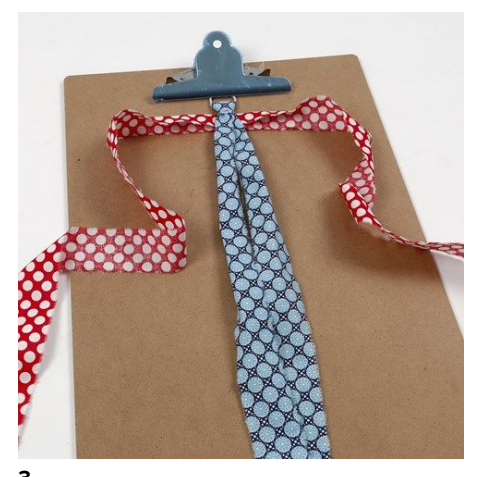
Cut and tear another 3 x 60 cm strip. Arrange it so that the middle is underneath the strip of fabric already attached to the macramé board.