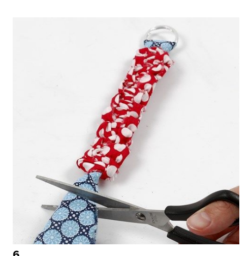
Trim the excess fabric at the end to a suitable length.