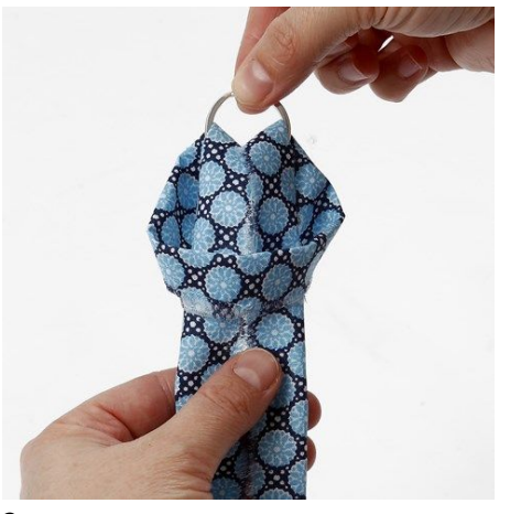
2. Fold the strip lengthwise so that it now measures 1.5 cm in width. Iron and attach it to the spilt ring as shown. Attach the split ring with the strip of fabric to the macramé board.