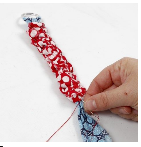
5. Finish by securing the last braiding knot using a needle and thread.