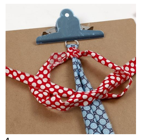
Make braiding knots on the strip of fabric in middle using the two strips on either side.