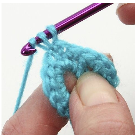
4. In the next round crochet 2 double crochet stitches into each stitch. Finish with a slip stitch.