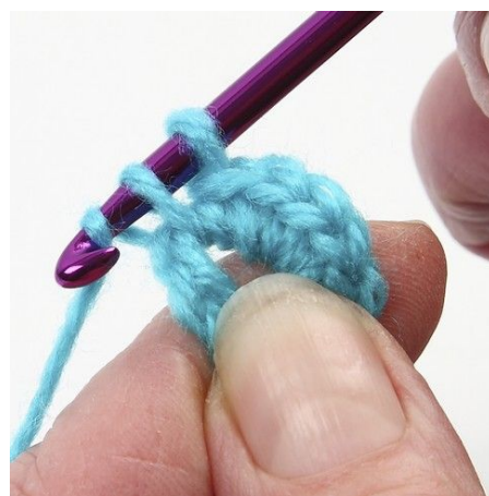
3. Crochet 10 double crochet stitches around the ring and finish with a slip stitch.