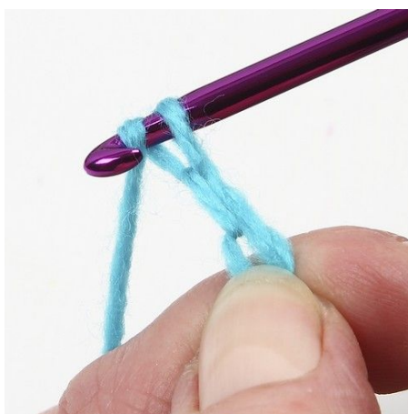
1. Crochet 4 chain stitches.