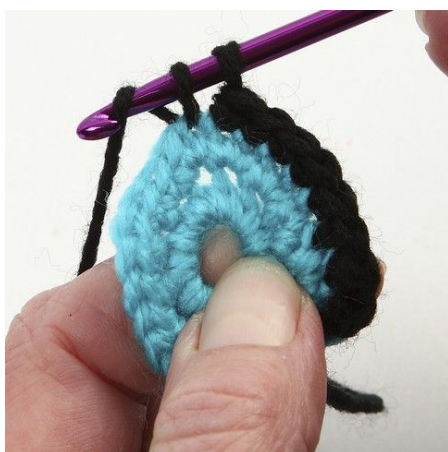
5. Change to a different colour yarn and crochet 1 double crochet stitch into each stitch all the way around. Finish with a slip stitch.