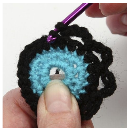
6. In the next round crochet 4 chain stitches, skip 2 double crochet stitches and crochet down with a slip stitch. Repeat all the way around the ring, making 10 arches in total.