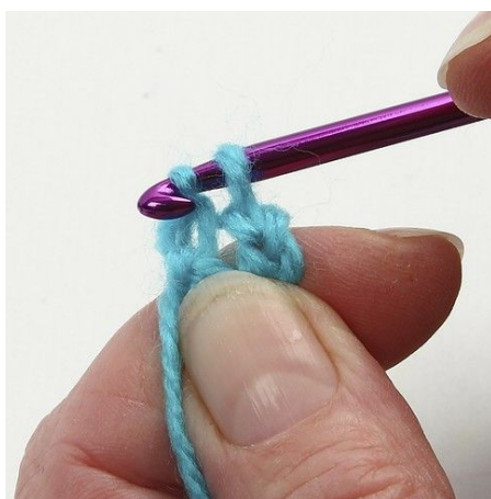
2. Make a ring by finishing with a slip stitch in the first chain stitch.