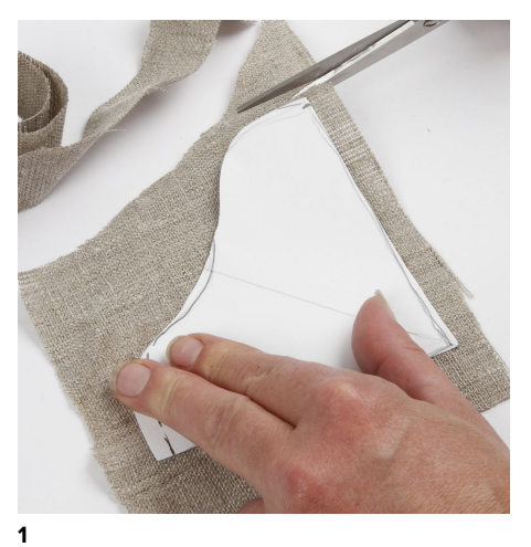
• Cut out the pixie hat using the template.