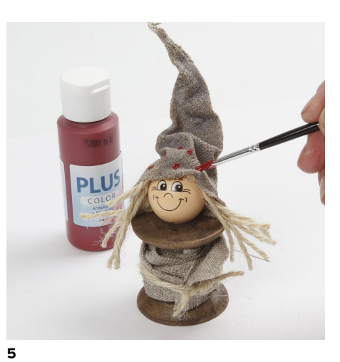
Finally paint small dots on the pixie hat.