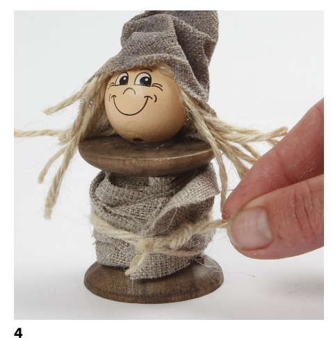
Wind the excess linen fabric and paper cord around the bobbin.

Soak the linen fabric with glue lacquer and shape a hat. Let it dry.