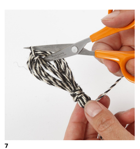
Cut open the bundle.