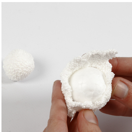
13 Cover two round polystyrene balls with white Foam Clay.