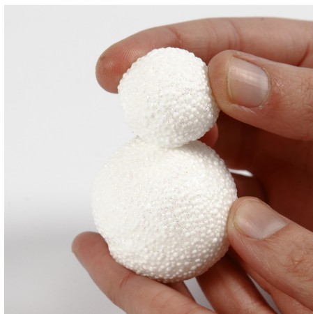
14 Place the balls on top of each other.