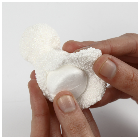
17 Cover the polystyrene bodies with Foam Clay. See the next steps for the distribution.