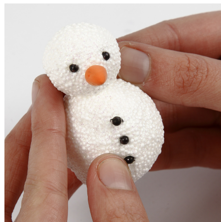
15 Make a nose from orange Silk Clay and attach. Press Silk Clay eyes and buttons onto the figure.