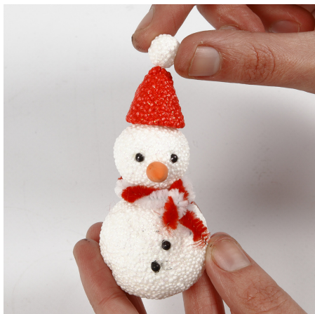
16 Model a small pixie hat from Foam Clay and press onto the top of the head. Make a scarf from pipe cleaners (see steps 26-27) and wrap it around the neck.