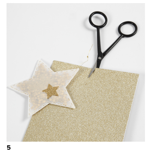
Decorate the star with glitter stickers.

Make an incision at the top in the middle of the greeting card. Tie the two threads together with 5-6 tights knots. Attach the knot onto the back of the greeting card into the slot. Decorate the Christmas card further by attaching a couple of small glitter sticker stars.