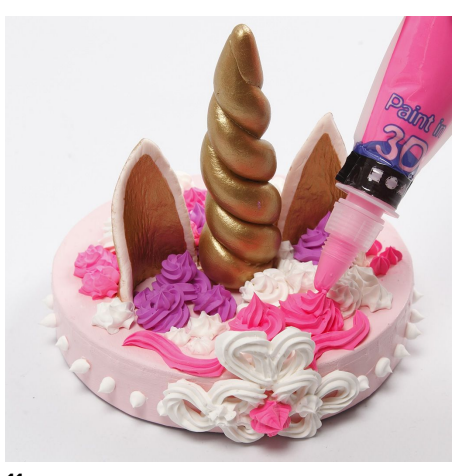
11 Decorate directly on the box lid.

Lightly press the horn and the ears onto the small box lid. (Silk Clay sticks onto items without using glue).