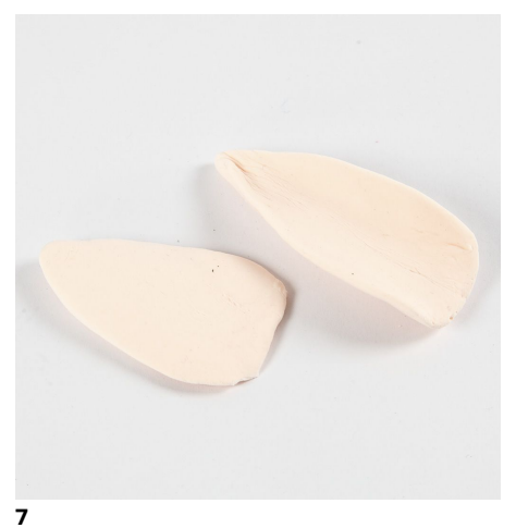
Roll out a piece of Silk Clay for ears, cut in half as illustrated.