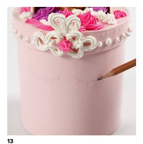
Draw eyes with a pencil. Make sure that the joint of the box is at the back.