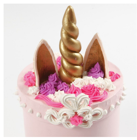
12 Place the finished lid on top of the box.