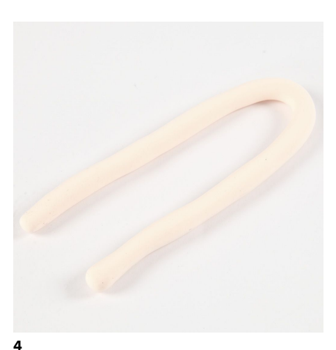
Roll out a piece of Silk Clay measuring approx. 30 cm for the horn.