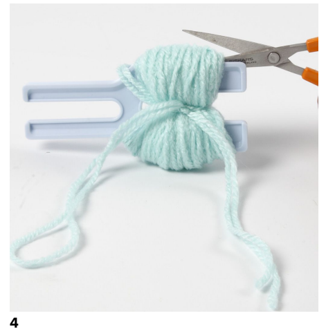
Cut the yarn open on one side of the tool. The tool has a deep groove all the way around to allow room for the blade of the scissors.