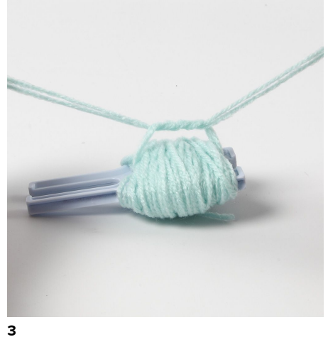
Tie the doubled-over piece of yarn tightly around the wound bundle of wool.

Cut a piece of yarn to your chosen length and double it over. This is to be used for tying the pom-pom at the end. Place this doubled-over piece of yarn on the tool as illustrated. Now wind the yarn from the ball approx. 100 times around the widest of the two forks of the tool. (NB: this tool enables you to make pom-poms in two different sizes, dictated by the narrow or wide fork).