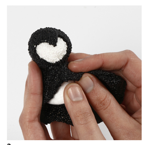
Penguin: Cover the head with white Foam Clay first and then add black Foam Clay as shown.