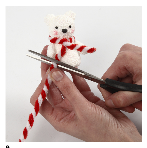
Twist and tie the scarf around the animal's neck and trim.