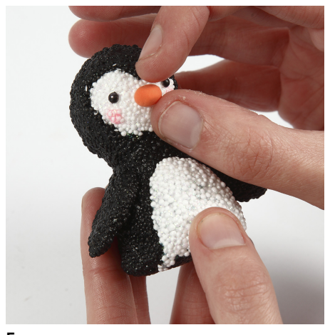
5 Make the penguin's beak from orange Silk Clay.