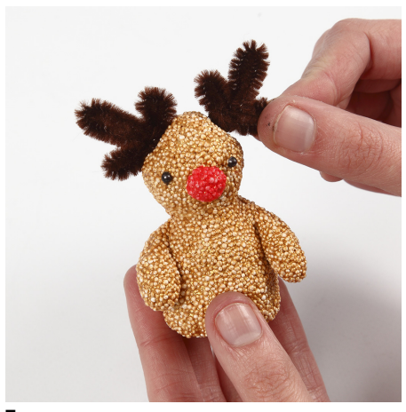
Push the antler onto the head without using glue. Use red Foam Clay for the nose and push in black plastic studs for the eyes.