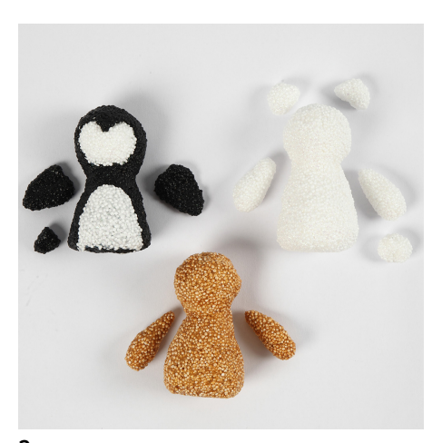
Attach arms, tails, ears etc. depending on the animal you make.