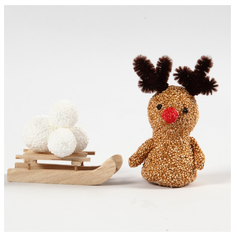
10 Make snow balls from white Foam Clay.