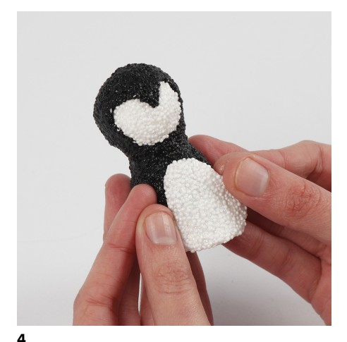
Add white Foam Clay on the front of the penguin for a white tummy.