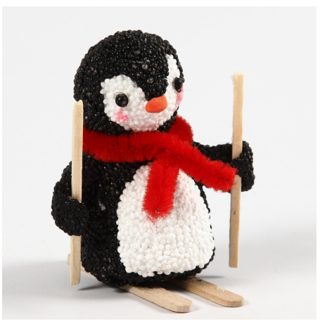
11 Attach the skis and ski poles (made from small ice lolly sticks) whilst the Foam Clay is still damp without using glue.