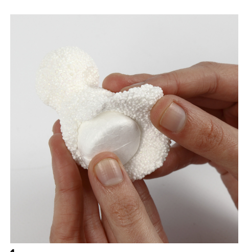
Cover the polystyrene cone bodies with Foam Clay modelling clay.