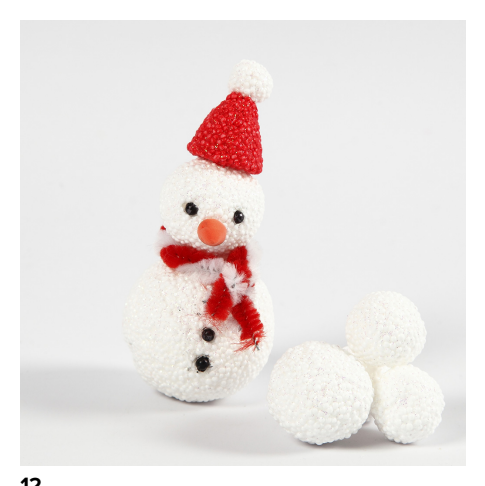
You may also make a small snowman from balls.