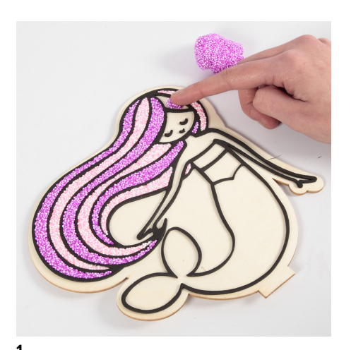
Apply Foam Clay to the gaps left by the black foam rubber inlay.