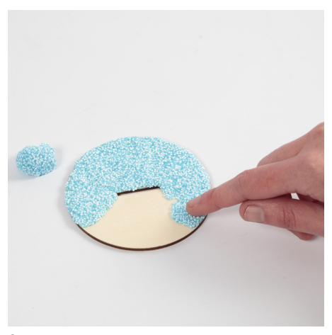
Cover the disc with Foam Clay. The finished figure will stand in the slot in the middle of the