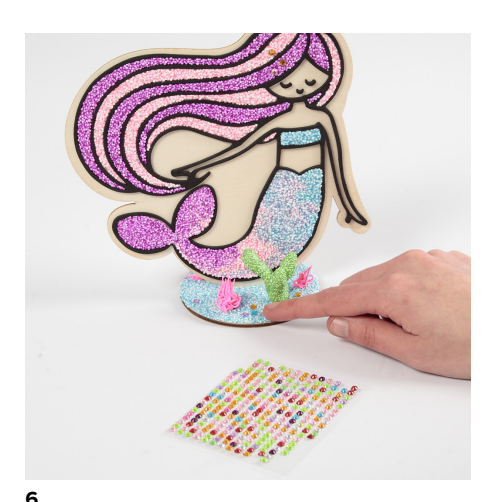
Finally decorate the disc and the figures with rhinestones