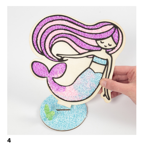
Place the figure in the slot in the middle of the