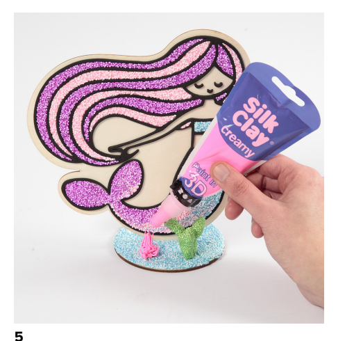
Attach a nozzle to a Silk Clay creamy bottle and make flowers by lightly squeezing the bottle.