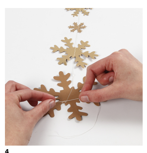
Tie a double knot at each end to secure the threads.