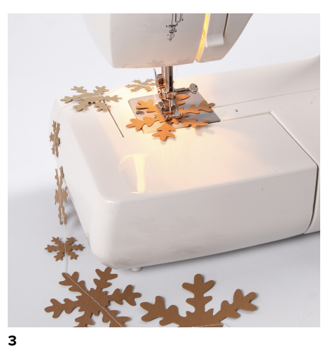
Continue like this until a suitable length is reached. Cut off the threads leaving a gap from the last snowflake.

Continue sewing without anything under the pressure foot to make a gap between the next snowflake. Place another snowflake under the pressure foot and sew down through the middle of the snowflake.