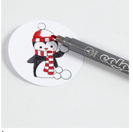
1 Colour in the designs with markers.