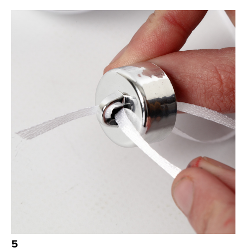
Thread the ribbon through the decorative metal hanger at the top – up through each side of the loop.