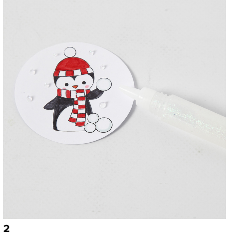
Decorate with glitter pens.