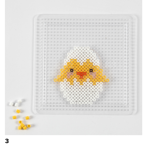
Easter chick. See more in idea No. 15343.