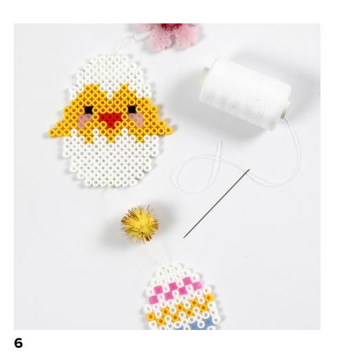
Assemble the garland by passing a thread through the middle fuse bead of the figures. Add the pom-poms by threading them onto the thread between two Nabbi fuse bead figures.

Place a piece of ironing paper or baking paper on top of the beads and iron them together with an iron. Do a small test beforehand as the temperature varies from one iron to another. Iron the beads so that they lightly melt together and then remove them carefully from the pegboard (still with the ironing paper or the baking paper on top). Place a book or a heavy object on top until the beads have cooled down, then remove the ironing paper or baking paper. You may iron the figures on both sides for extra stability.