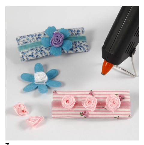
Glue flowers onto the ribbon.