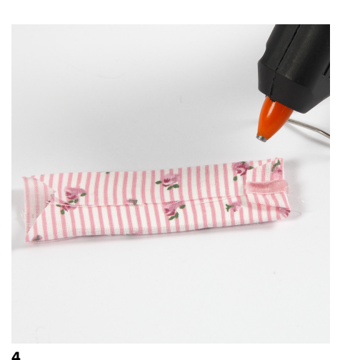
Fold the ends around the card and secure them with a glue gun.