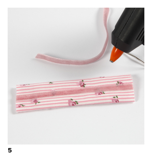
Glue velvet ribbon onto the front.