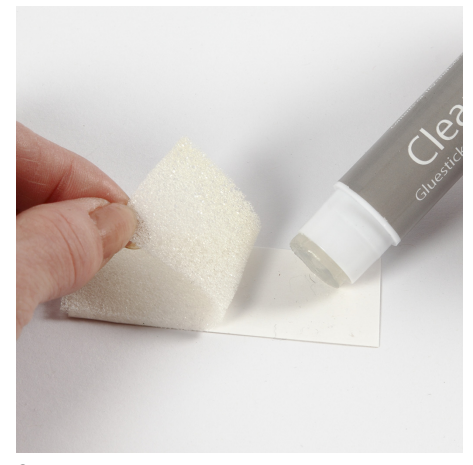
Glue the piece foam washcloth onto the piece of card.