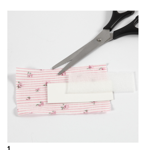
Cut a 2.5 \times 7 cm piece of card, a 2.5 \times 7 cm piece of foam washcloth and a 6 \times 10 cm piece of fabric.