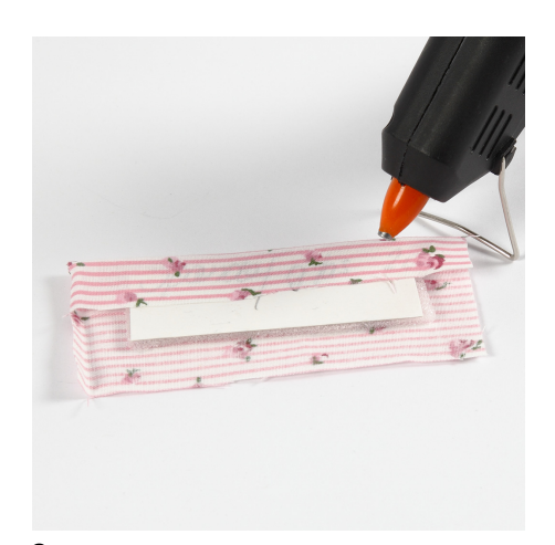
Glue on the piece of fabric.