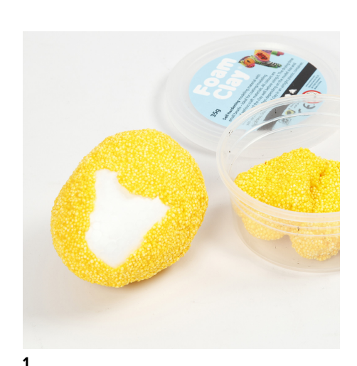
Cover a 7 cm polystyrene egg with Foam Clay.