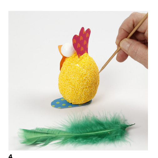
Make a hole downwards in the back of the hen and insert the feather into the hole.