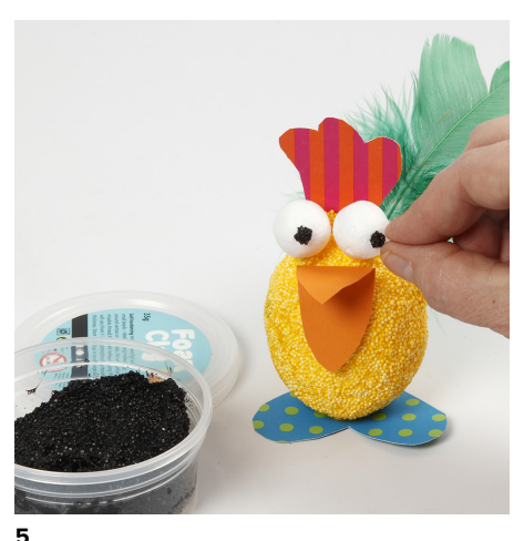
Roll two small black Foam Clay balls and press them onto the eyes.