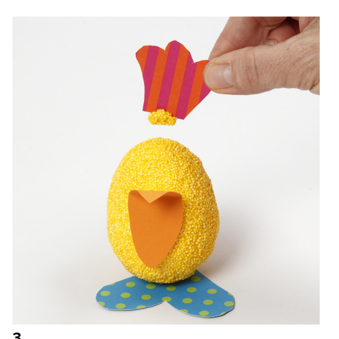
Attach the cut-out card parts and two small polystyrene balls for the eyes using small blobs of fresh Foam Clay.