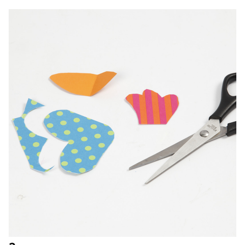
Print out the templates which are available as a separate PDF file for this idea. Cut out a beak, a cockscomb and feet from card, using the templates whilst the egg is drying.