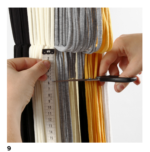
Pull the outer layer of strings to one side and trim the inner layer so that it measures 5.5 cm.