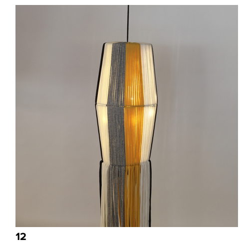
A Tip: Insert LED fairy lights inside the lamp shade to get more light. It is important that it doesn't get too hot; use LED fairy lights.

Tie a piece of black spaghetti (fabric) yarn around a lolly stick and insert it through the top of the top lamp shade. You can now hang the lamp shade.