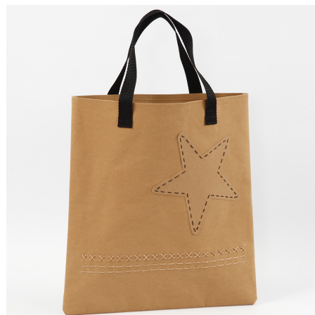
6 Embroider the design along the edge with leather cord.