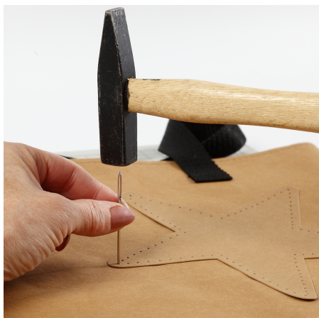
4 Make holes for the embroidered design through the star.