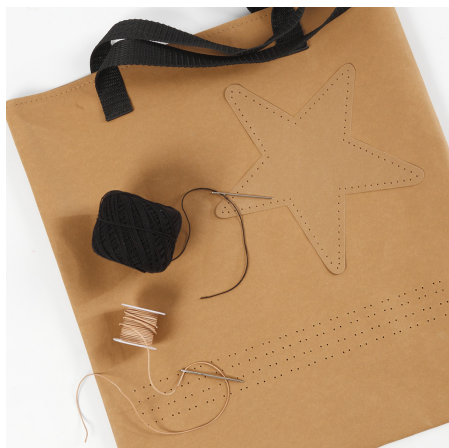
5 Embroider with tacking stitches along the outline of the star with cotton yarn.