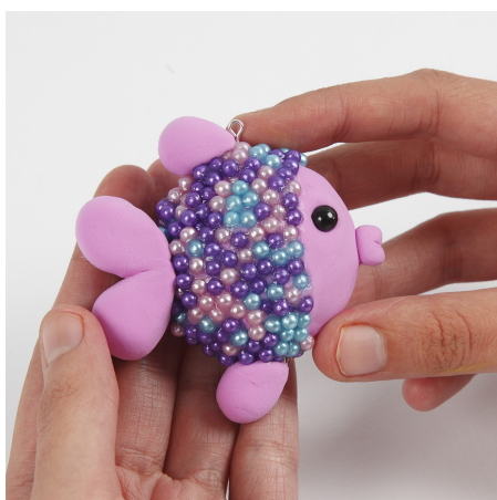
4 Attach the tail and push plastic eyes into each side of the head. You may insert an eye pin into the top of the fish and thread a piece of string through the loop for hanging.