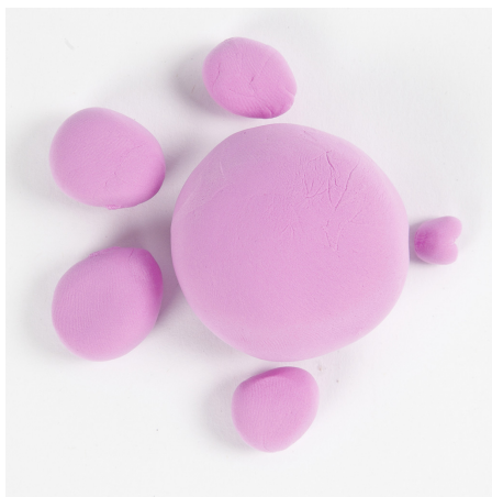
2 Model Silk Clay parts as illustrated in this photo and attach the fins and the mouth onto the fish.