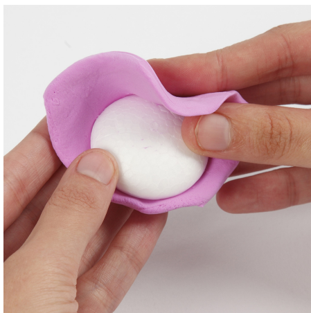
1 Cover the polystyrene UFO with Silk Clay.