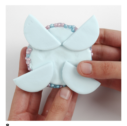
Attach the semi circles underneath the bottom as shown in this photo.