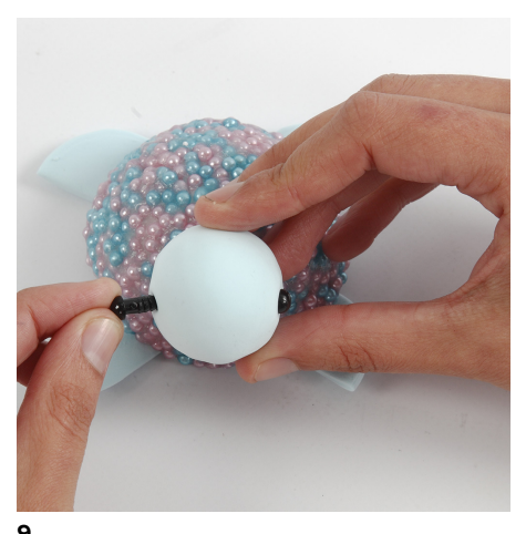
Attach the head onto the turtle and push an eye onto each side of the head.