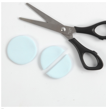
7 Roll out the Silk Clay flat and cut two circles measuring approx. 4 cm in diameter for the large turtle and 3 cm in diameter for the small turtle. Cut the circles in half.