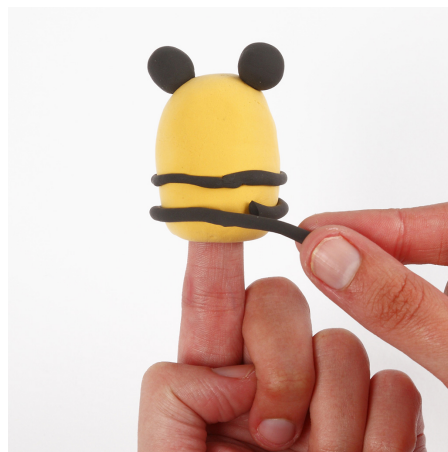
3 Make the stripes for the bee by rolling a thin Silk Clay sausage and attaching it around the body.