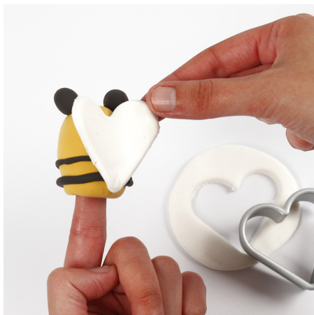
4 Attach the wings by pushing them onto the back of the figure.