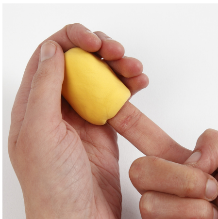
1 Put a blob of Silk Clay around your finger.