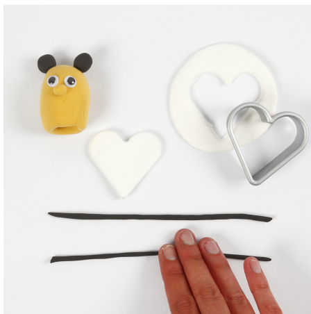
2 Now model all the parts needed for the finger puppet. All the parts should be attached to the figure when the figure is on your finger to prevent it from losing its shape. This Silk Clay heart is cut out with a shape cutter. Alternatively you may use a pair of scissors.