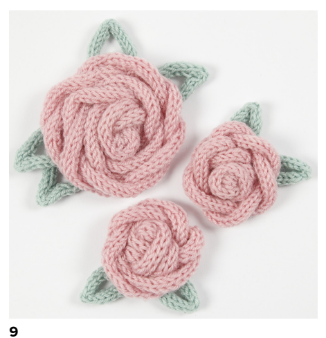
Sew the leaves onto the back of the roses and sew the finished roses onto the front of the shopping bag.

Knit approx. 50 cm knitted tube for four leaves for the large rose. Shape the four leaves as shown in the picture and secure in the middle. Sew the points as described in the step above.