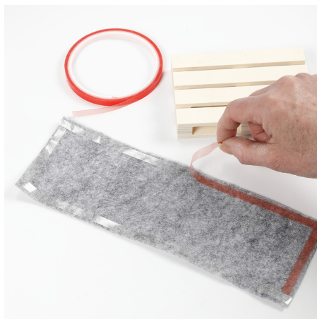
2 Cut an 8 x 24 cm piece of felt for the mattress for the mini pallet. Attach power tape along the edge (of the piece of felt).