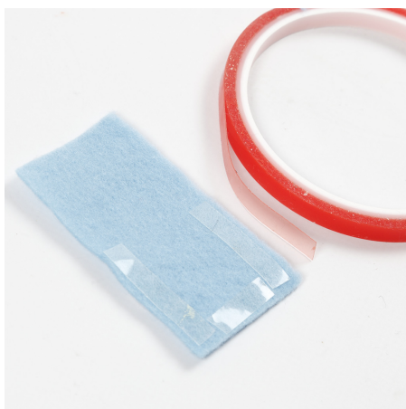
4 Cut two 4 x 8 cm pieces of felt for the pillows. Attach power tape along the edges.