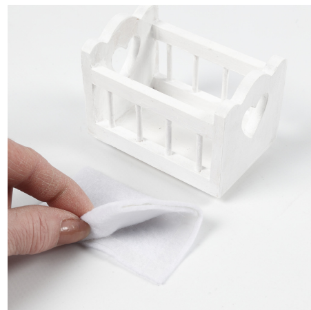
9 Triple fold the mattress.