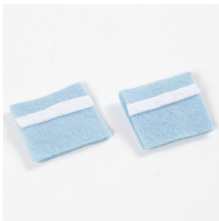
5 Double over each piece of felt and attach a strip of white felt on top.