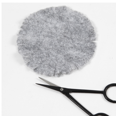
14 Cut a 9 cm diameter circle of grey felt for the rug. Cut tassels along the edge.