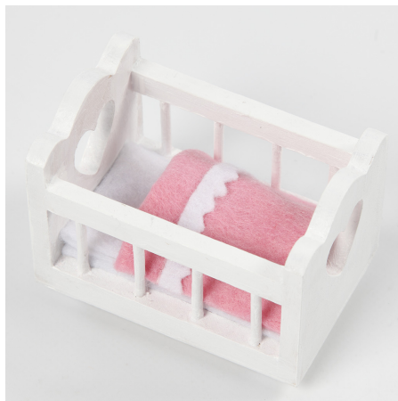
11 Make the cot by assembling the mattress, pillow and duvet.