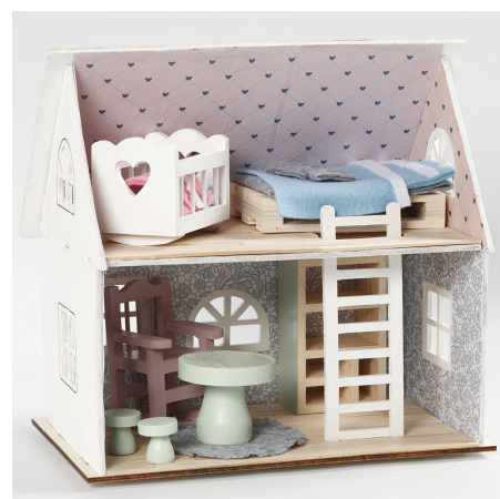
15 Make a doll's house – see idea No. 15611.