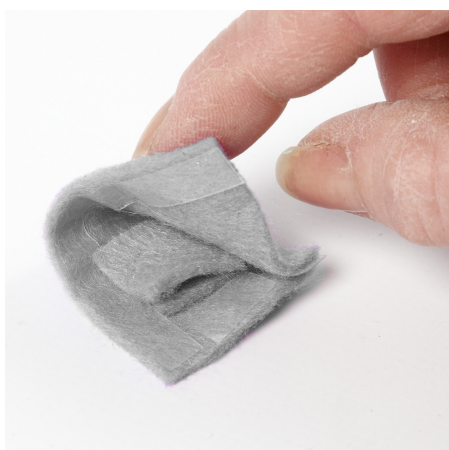
13 Place the filling inside the decorative cushions and fold in half.