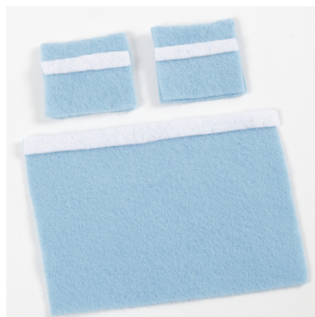
6 Make a duvet from an 8.5 x 12 cm piece of felt and attach a white strip of felt across the top.