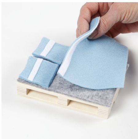
7 Make the bed by assembling the mattress, pillows and the duvet.