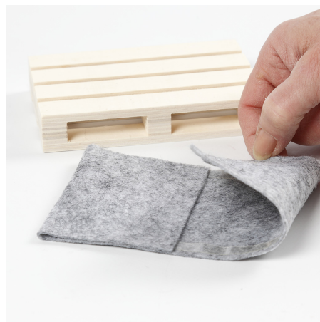
3 Fold towards the middle from each end.