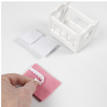
10 Double over the pillow and the duvet. Attach the decorative border onto the duvet.