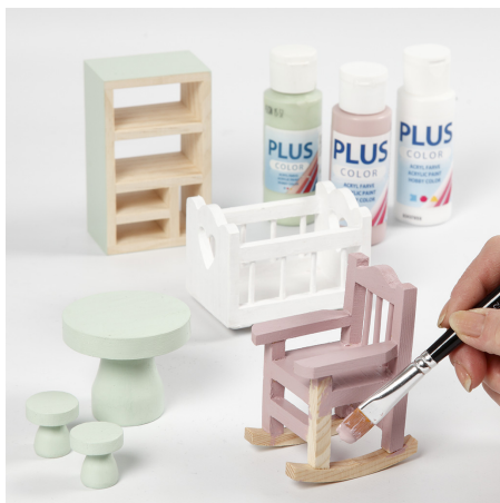
1 Paint the furniture with Plus Color craft paint.