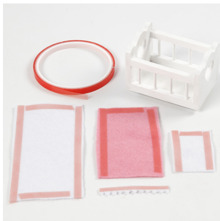
8 Cut a 7 x 13.5 cm piece of white felt for the cot mattress and a 6 x 10 cm piece of pink felt for the duvet. Cut a 4 x 6 cm piece of white felt for the pillow. Cut a 6.5 cm narrow piece of felt for a decorative border for the duvet (you may use pinking shears). Attach power tape onto the various pieces of felt as shown in the photo.