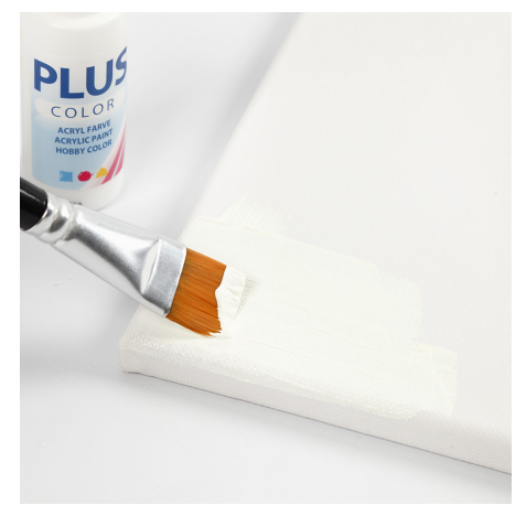
4 Paint the entire canvas with white Plus Color craft paint.

You may cut the rubber carving block in half enabling you to print the designs onto canvas individually. You may also mix the individual designs.