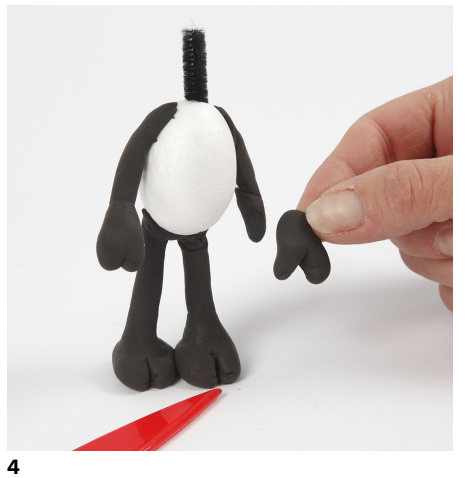
Repeat this technique when making the arms and the hands.