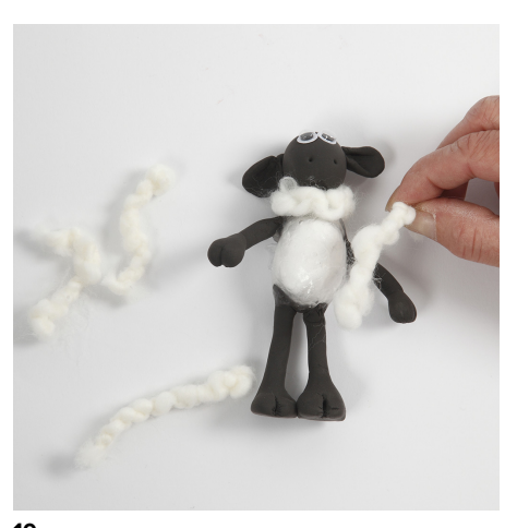
10 Attach the knotted XL yarn all over the body.

Attach Sticky Base onto the body and onto the top of the head.