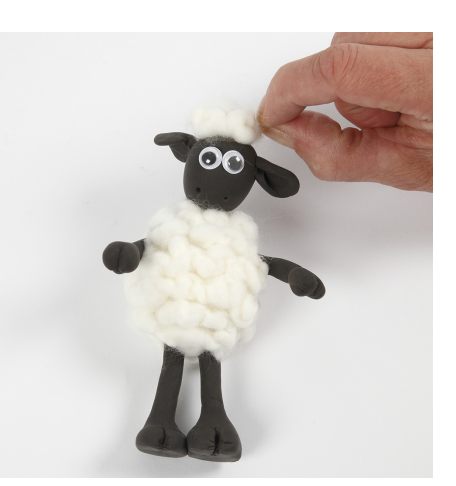
11 Attach a strip of knotted XL yarn on top of the head and on the back for the tail.