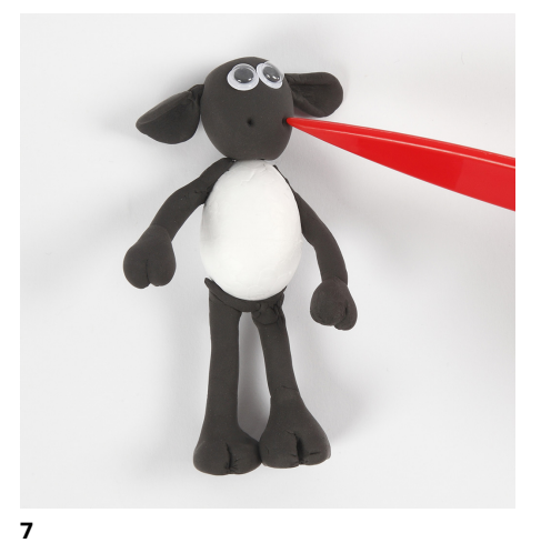
/ Make two nostrils using the modelling tool.