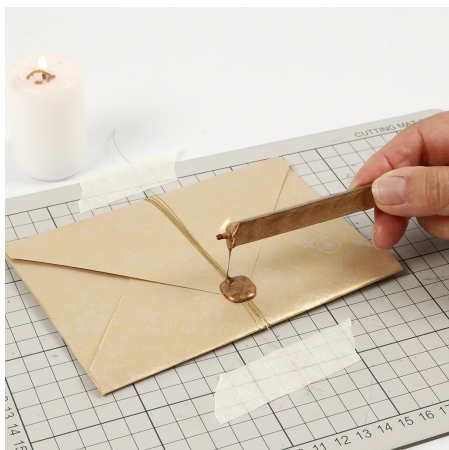
7 Light the sealing wax stick and drip wax onto the back of the envelope to seal it.