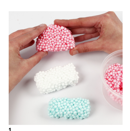
Model the ice Iolly parts from Foam Clay XL.