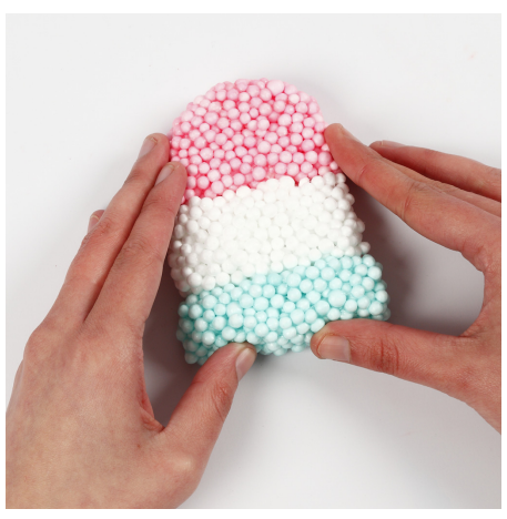
2 Push the parts together gently. Foam Clay sticks to itself as well as to papier-mâché, polystyrene, wood and other absorbent surfaces as long as it is moist.