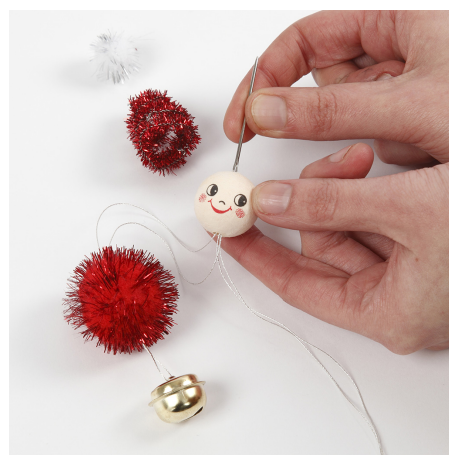
3 Tie a bell onto a piece of silver thread. Thread the silver thread onto a needle. Thread all the elf parts onto the doubled-over piece of silver thread.