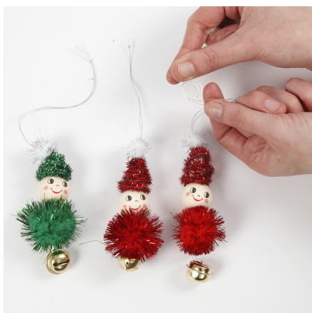
4 Tie a knot at the doubled-over end of the silver thread for hanging the elf as decoration.