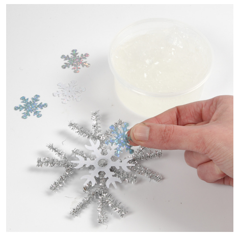
10 Decorate the snowflakes by attaching a snowflake sequin in the middle using Sticky Base.