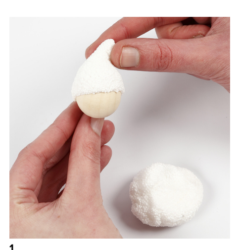
Model a Foam Clay elf's hat onto one half of a wooden bead. Foam Clay sticks on wood as long as it is moist.