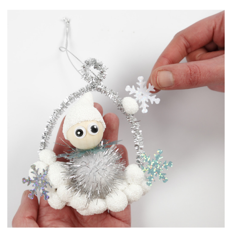
Attach a piece of silver thread through the loop for hanging and decorate the hanging decoration further with sequins snowflakes by pushing them into the Foam Clay balls.