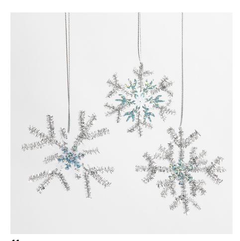
Attach a piece of silver thread to the snowflakes for hanging.