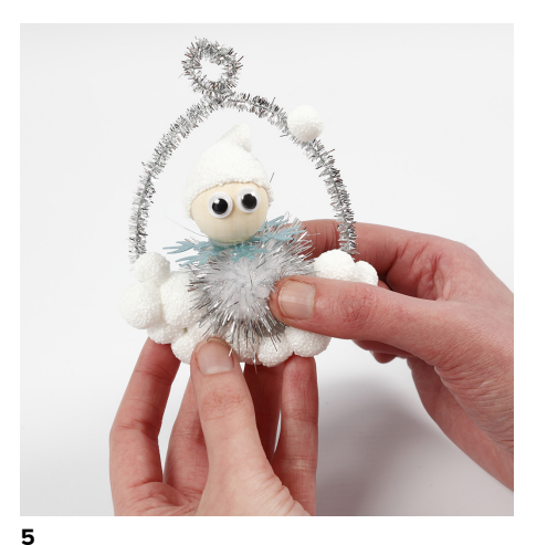
Attach the elf onto the Foam Clay balls. You may attach more balls to ensure that the elf sits securely in the middle.