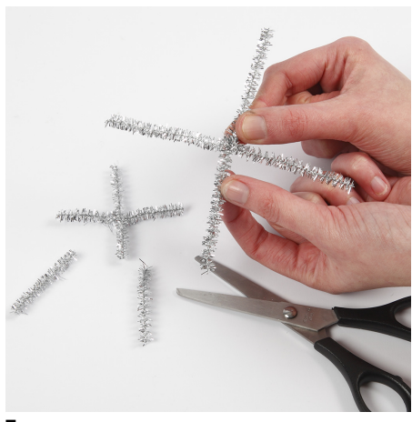
7 Make a snowflake hanging decoration by placing two pipe cleaners in a cross in the middle and secure them by twisting them together. Make a large cross and a slightly smaller one.