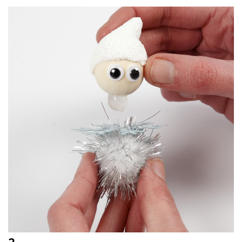
Attach self-adhesive googly eyes onto the wooden bead. Attach a sequin snowflake onto glitter pom-pom using Sticky Base and then the wooden bead on top using Sticky Base as shown in the photo.