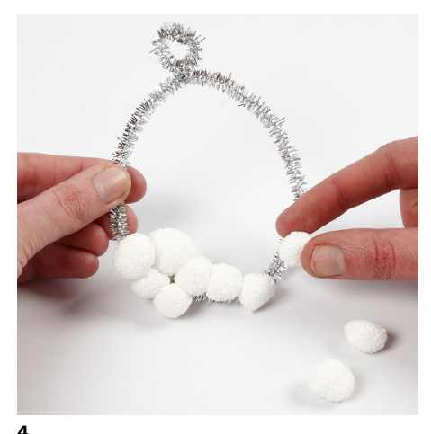
Roll small Foam Clay balls and push them onto the pipe cleaner.