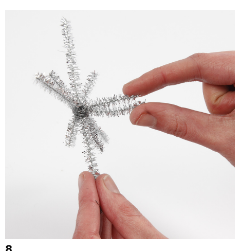
Tie the two crosses together in the middle with a small piece of pipe cleaner so that the crosses are staggered.