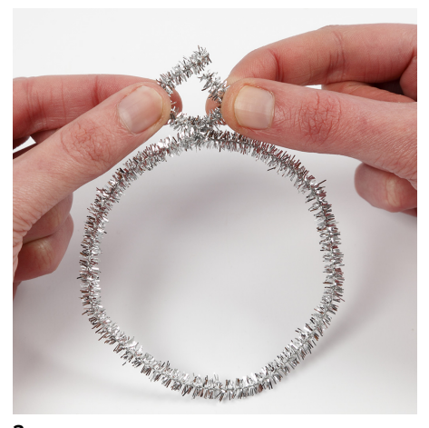
Make a circle with a loop for hanging from a piece of pipe cleaner.