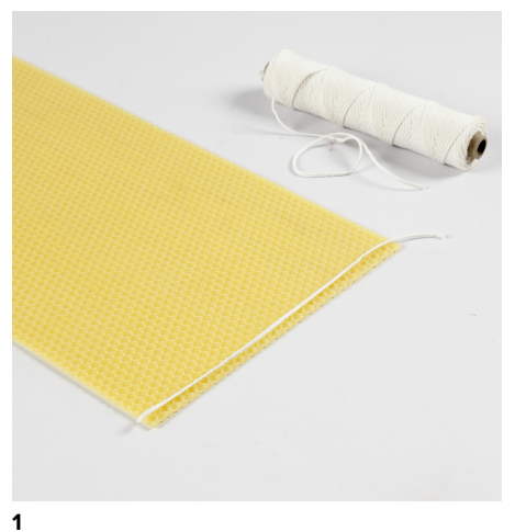
Cut a wick for the beeswax candle slightly longer than the short end of the beeswax sheet.