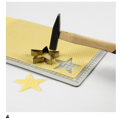
Punch out six stars for the star-shaped candle using your chosen shape cutter. Tap lightly with a hammer if the wax is too hard.

Roll the beeswax sheet until you have reached the end and continue with another beeswax sheet for a thicker candle.