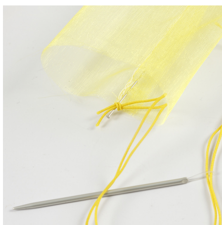
11 Cut an approx. 30 cm piece of elastic beading cord, depending on the thickness of your hair. Double over the cord and tie a knot as shown in the photo. Feed the elastic cord through the organza fabric tube. A tip: secure the elastic cord with a pin to the fabric at one end to prevent the cord from coming out at the other end.