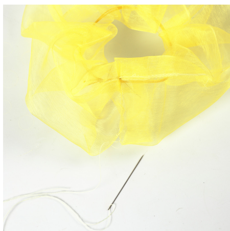
13 Fold in the edges and sew the fabric together as described in step 6.