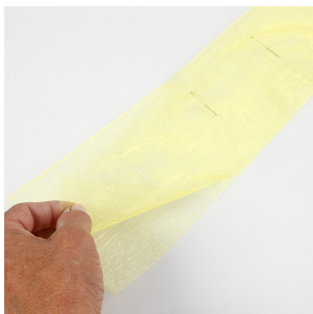
8 Double over the organza fabric and secure with pins.