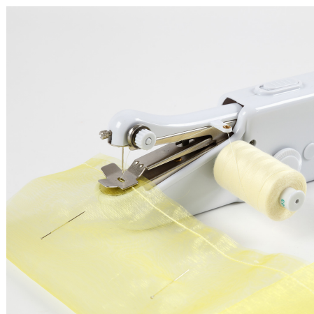
9 Sew the organza fabric together along the edge. A tip: the handheld sewing machine can be used with ordinary spools of thread, however, no bigger than 6 cm. You will need to use the supplied long pin. Follow the instructions in the supplied booklet and thread the handheld sewing machine with thread that matches the organza fabric.