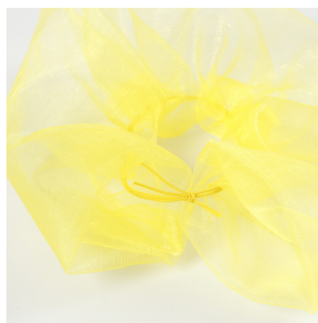
12 Tie the two cord ends together tightly, creating a ring as shown in the photo.