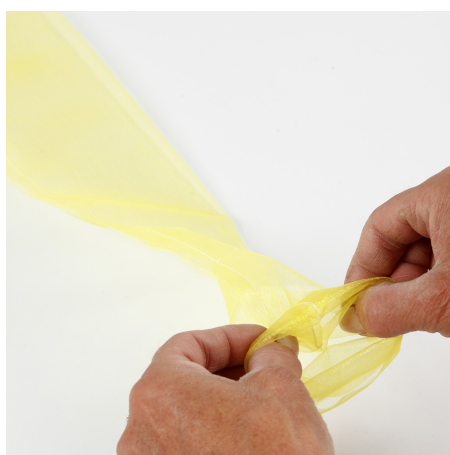
10 Turn the fabric right side out.