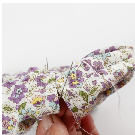
7 Sew the two ends together by hand.