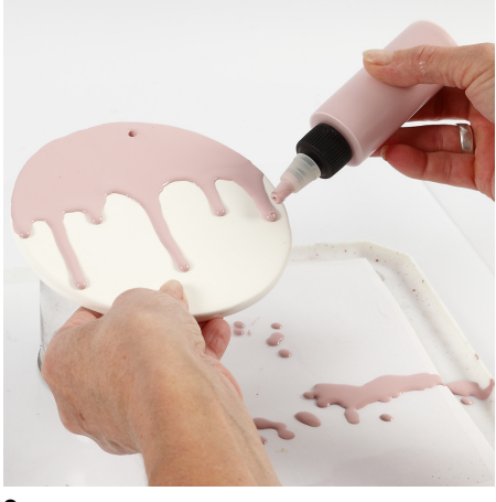
Hold the plate at an angle. Add drops of the paint mixture along the edges of the waves to make them run. Place the plate down flat when you want to stop the paint running.