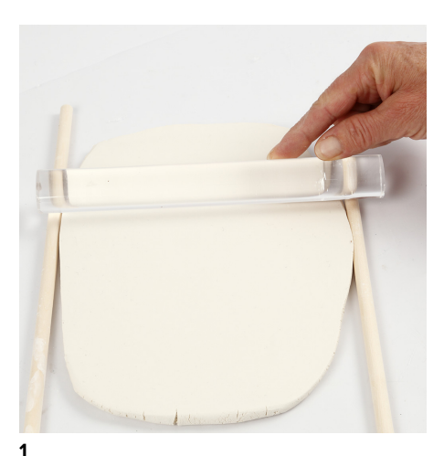
Roll out the clay using two 8 mm round wooden sticks to achieve the same thickness of the plate. The clay must be min. 7 mm thick.