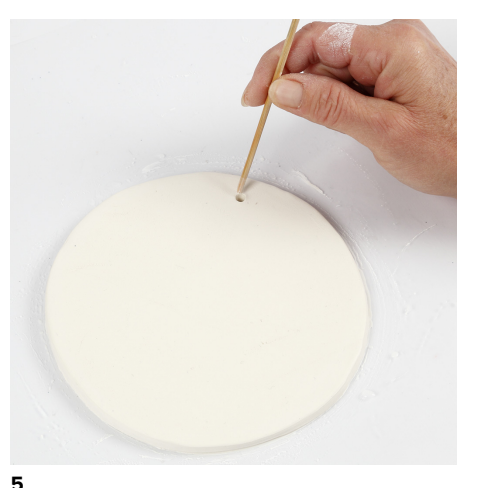
Make a hole for hanging and leave to dry. Turn the plate over a couple of times whilst bowl once dry, you can repair these by mixing a small amount of clay with a bit of water to form a creamy consistency. Fill the cracks with the mixture, preferably with a brush. Leave to dry. Any uneven areas on the plate can be sanded smooth with a sanding sponge or with fine sandpaper.