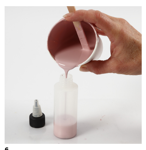
Drying time is approx. 48 hours depending on the room temperature. You may place it near a when the plate is completely dry. Mix Plus Color craft paint with Pouring Fluid. The mixing ratio is approx. 1 part paint to 4 parts of Pouring Fluid. The finished mixture must be runny. amount according to the size of the refillable plastic bottle. Pour the mxiture into the plastic