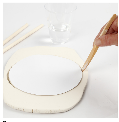
Place the attached template on top of the clay and cut out.