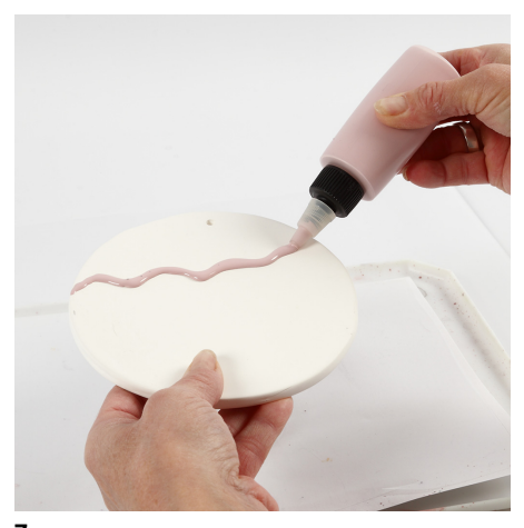
Draw a wave on the plate with the mixture from the bottle.