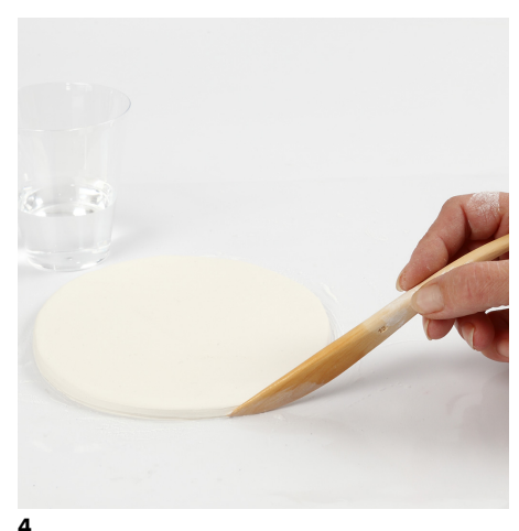
Dip the modelling tool in water and smooth out the edge.