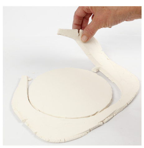
3 Remove the excess clay.