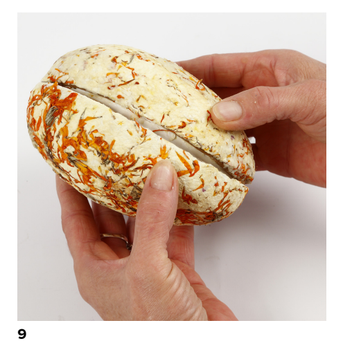
Make sure that the lid fits. Leave to dry.