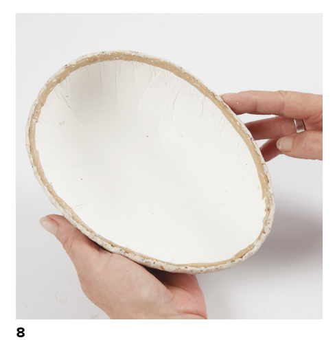
Check the lid edge to ensure it is smooth.