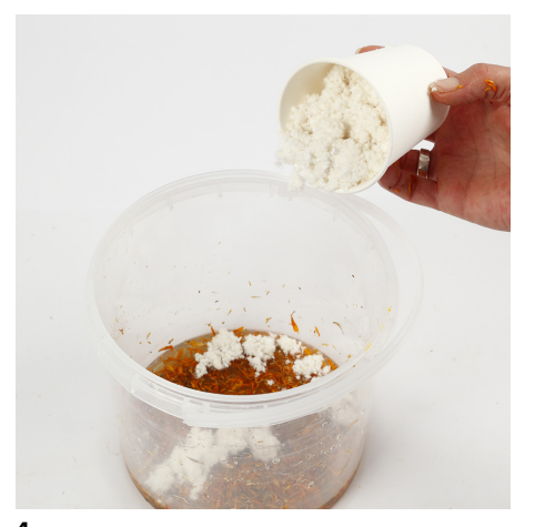
4 Add 3 cups of papier-mâché pulp.