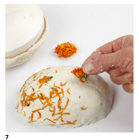
Add dried flowers to the lid whilst the papier-mâché pulp is still wet.