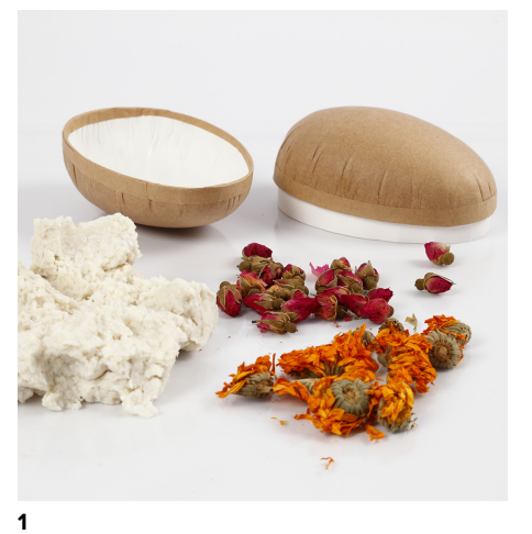
Add different looks to the eggs with dried flowers mixed with papier-mâché pulp.