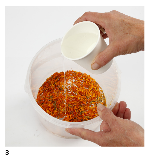
Add a cup of water and mix.

Crush a handful of dried marigolds in a bucket.