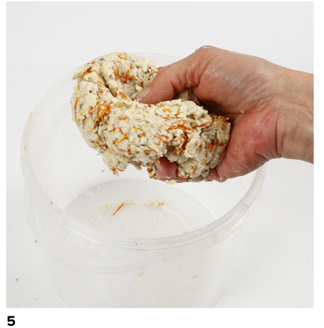
ь Mix well.