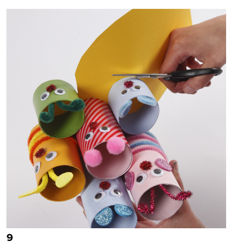
Once the Sticky Base is dry (takes approx. 24 hours), cut around the tubes.