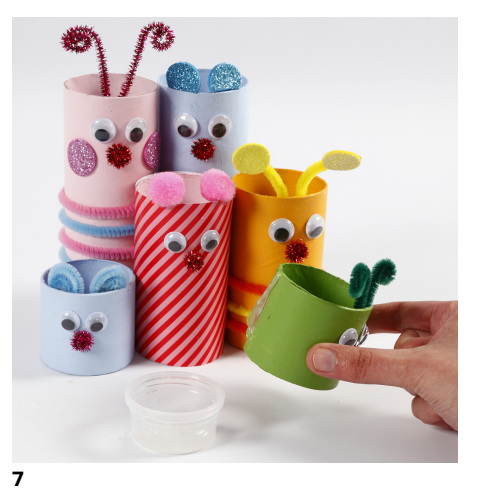
Stick the tubes together with blobs of Sticky Base between each tube.