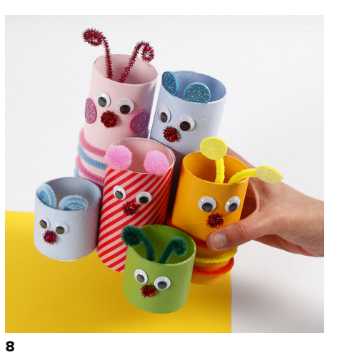
Make the base by attaching Sticky Base around the edges of the tubes. Press the tubes onto a piece of card.