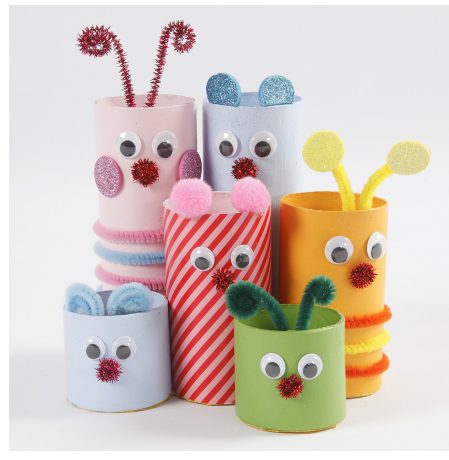
10 The finished pencil holder ready for use.