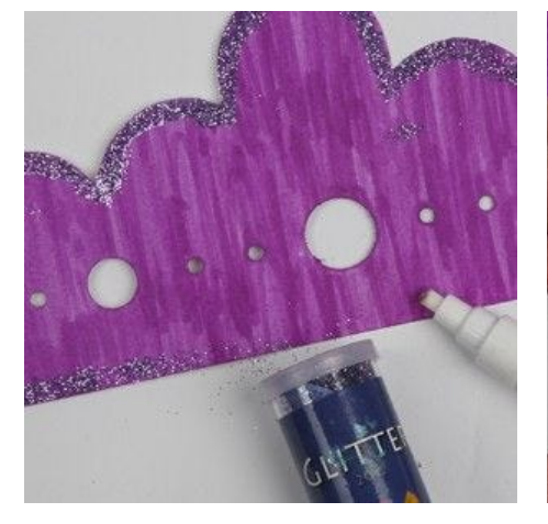
1 Colour in the card crown with markers. Draw along the edges with a glue pen, sprinkle glitter onto the wet glue. (We recommend applying glue along the edges, a small section at the time to prevent the applied glue from drying out).