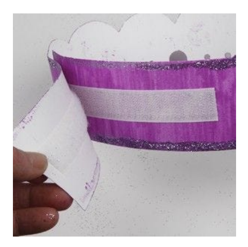
Attach one piece of velcro onto the front of the crown and the other piece of velcro onto the back.