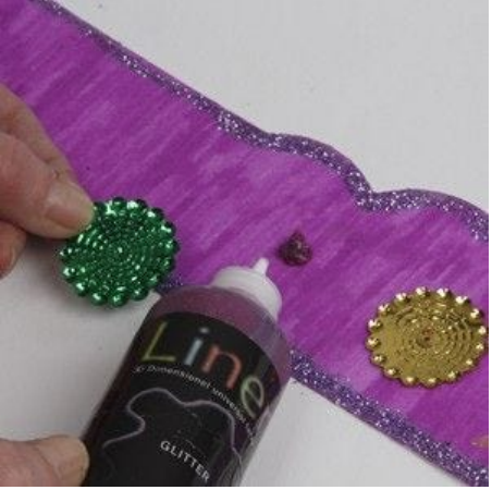
2 Decorate the crown according to your imagination using a glue pen, 3D-Liner and sequins. Attach the sequins with 3D-Liner.