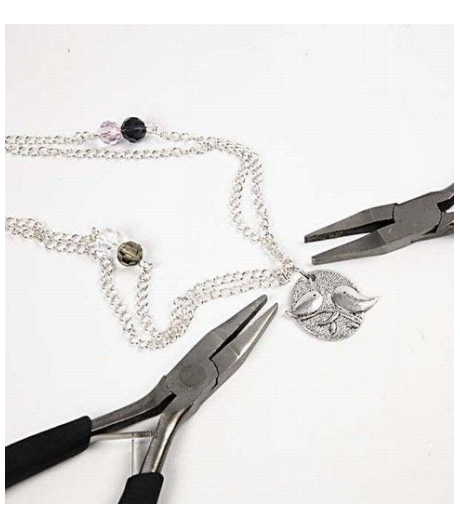
8. Finally attach a pendant with an oval jump ring.