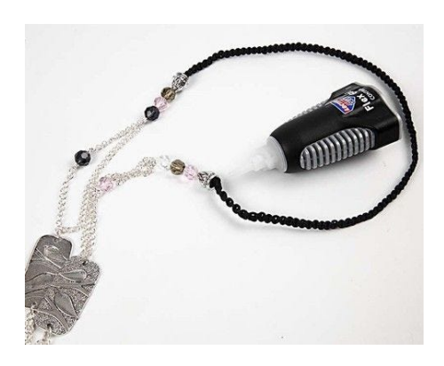
7. Finish the necklace by connecting it to the braided cord.