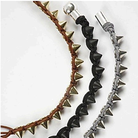
Another example -

6. Trim the ends approx. 1.5cm from the knot. NB: Make sure that the cord ends which are glued into the magnetic clasp cylinders fill the entire cylinder for maximum adhesion.