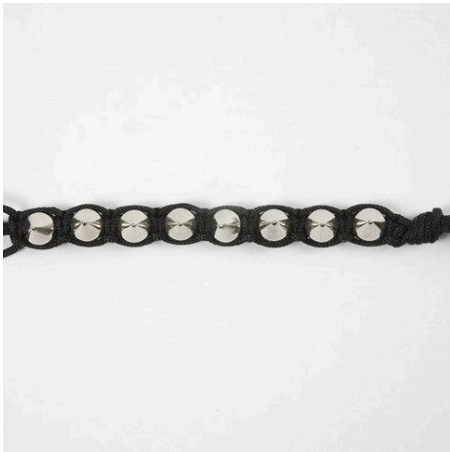
Another example -