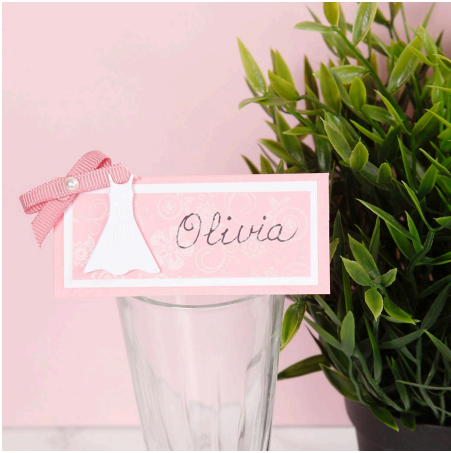
10 See our matching ideas: Place card 15695.