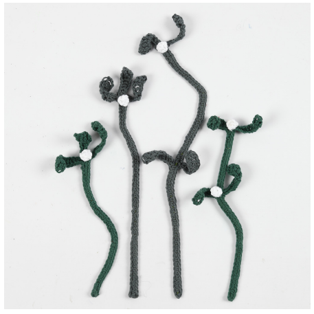
4 Find inspiration here for different crocheted stalks for the mistletoe.