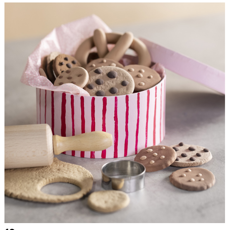
10 See idea No. 16182 on how to make a cake tin for your baked goods.