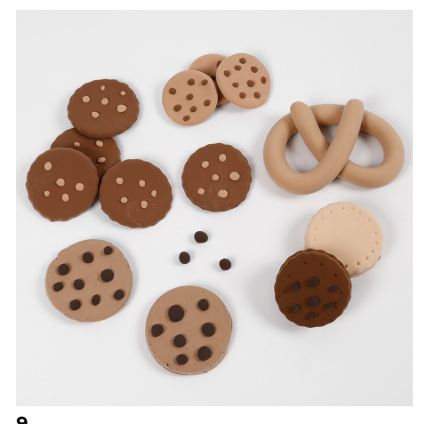
Different baked goods.