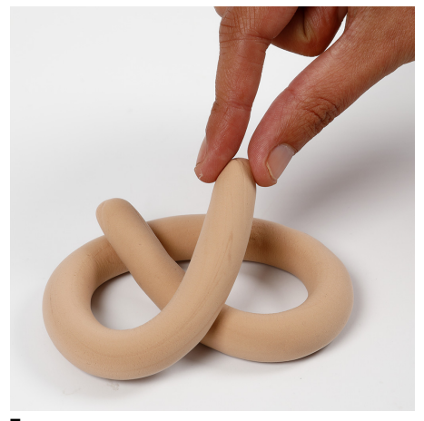
Shape the long sausage into a pretzel as shown in the photo. Please note that Silk Clay sticks to itself as long as it is moist and then it dries at room temperature.